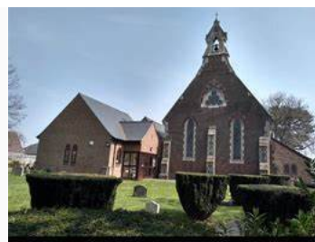
St Thomas' Stopsley

to the kind donor of the 160 th anniversary mugs, all money that came in from the sales has been profit for St Thomas's, and we have sold around 80 mugs. The mugs have now been reduced to £3 each and any unsold will be withdrawn from sale after Easter – so this is your last chance to get your souvenir mug at a bargain price!